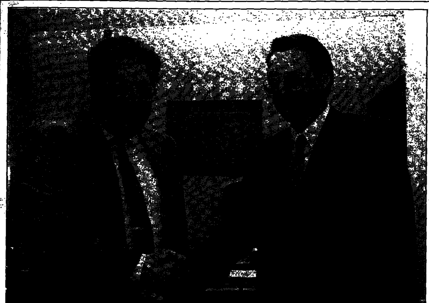
New envoy arrives

Freij's replacements in both jobs will be picked by Arafat.